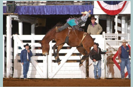
Friday, January 17 Cowboy/Cowgirl Day

This Month We'll Talk About . . . Happy New Year! Winter Weather Ride'm Cowboy Transportation What's Under Ground